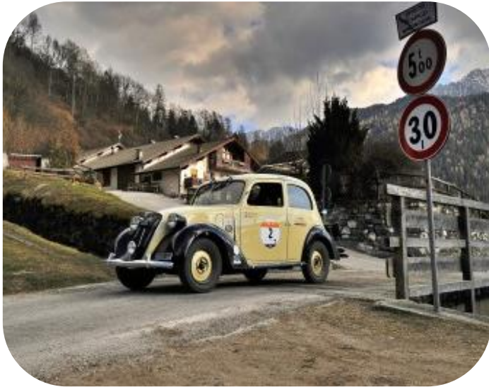
FIAT 508 C - 1937