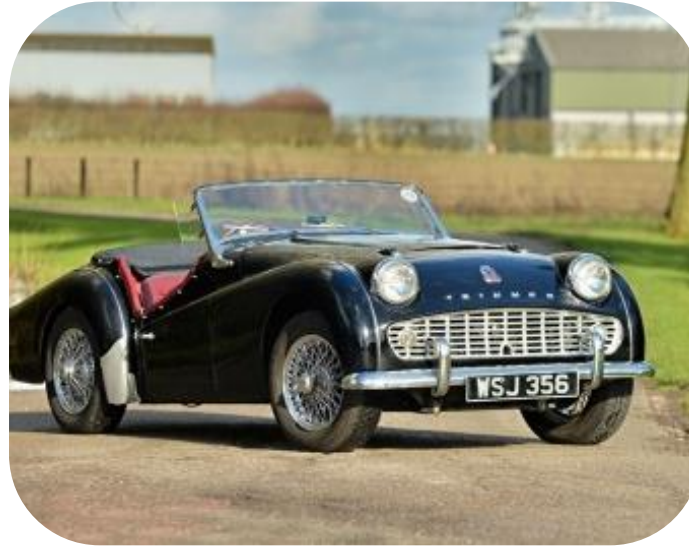
TRIUMPH TR3 - 1962