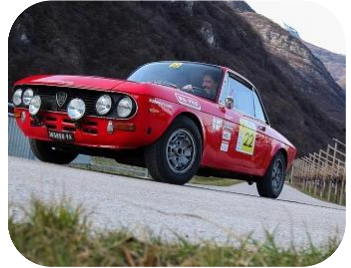
LANCIA FULVIA HF - 1971